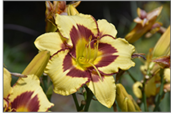
El Desperado Daylily flowers