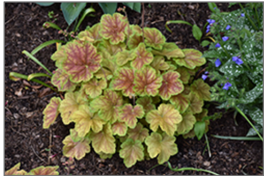
Miracle Coral Bells