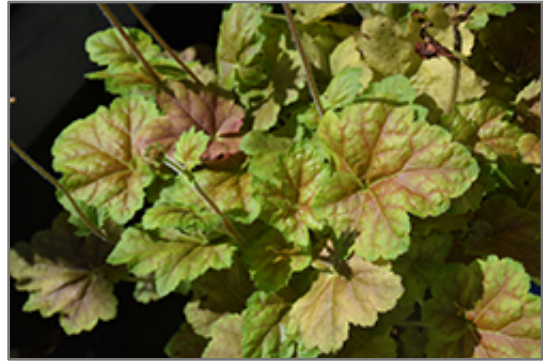
Miracle Coral Bells foliage

Miracle Coral Bells is recommended for the following landscape applications;