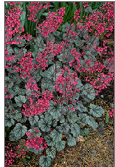
Rave On Coral Bells in bloom

Rave On Coral Bells is recommended for the following landscape applications;