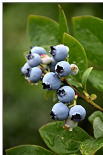
Northblue Blueberry fruit

Aside from its primary use as an edible, Northblue Blueberry is suitable for the following landscape applications;