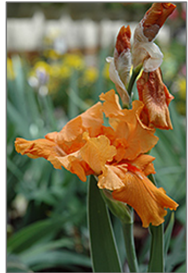
Firebreather Iris flowers