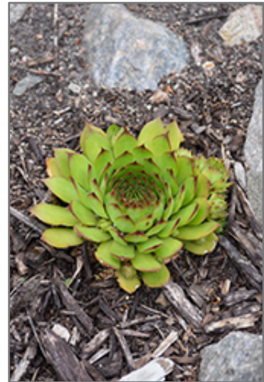
Sunset Hens And Chicks