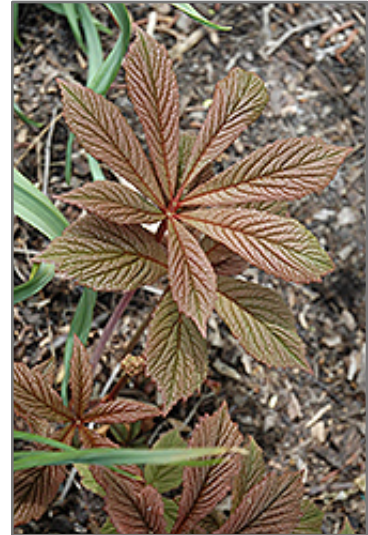
Die Schone Rodgersia foliage