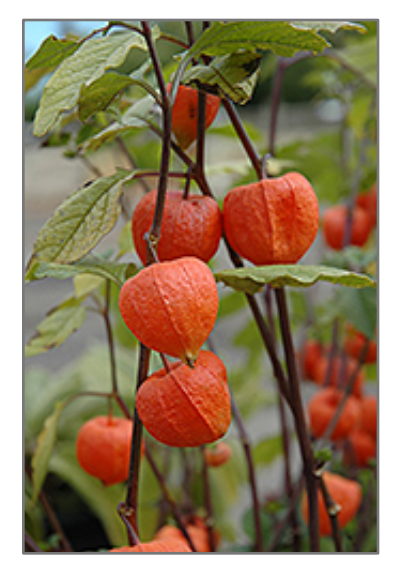
Chinese Lantern fruit

93 East Main Street Hopkinton MA 02148 - (508) 435-3414 160 Pine Hill Road Chelmsford MA 01824 - (978) 349-0055 COMMERCIAL: commsales@westonnurseries.com - (508) 293-8028