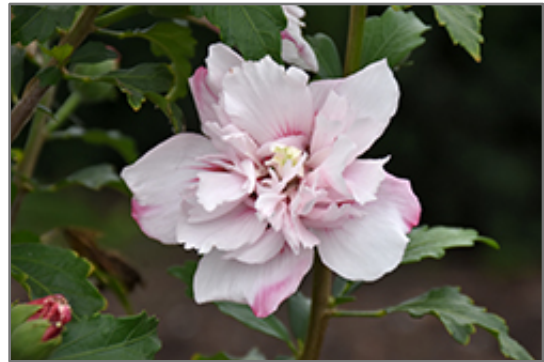
Lady Stanley Rose of Sharon flowers

Lady Stanley Rose of Sharon is recommended for the following landscape applications;