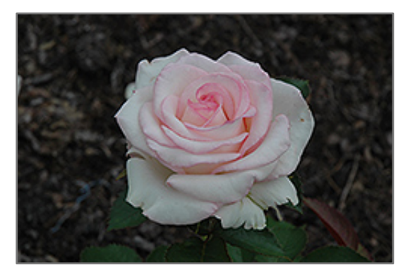
Moonstone Rose flowers

This shrub will require occasional maintenance and upkeep, and is best pruned in late winter once the threat of extreme cold has passed. It is a good choice for attracting bees to your yard. It has no significant negative characteristics.