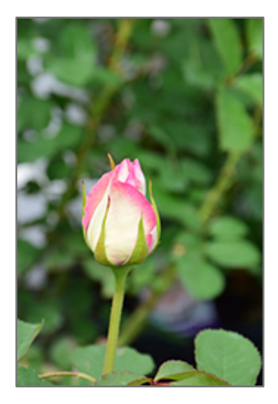
Moonstone Rose flower buds

Moonstone Rose is recommended for the following landscape applications;