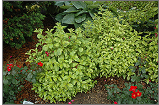
Ghost Weigela

This shrub should only be grown in full sunlight. It prefers to grow in average to moist conditions, and shouldn't be allowed to dry out. It is not particular as to soil type or pH. It is highly tolerant of urban pollution and will even thrive in inner city environments. This is a selected variety of a species not originally from North America.