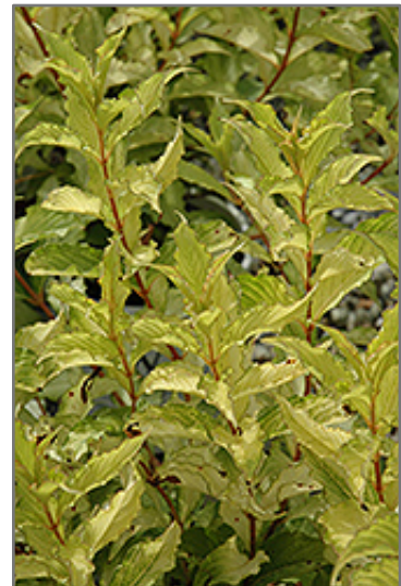
Ghost Weigela foliage