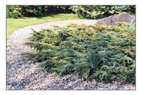
Holger Juniper