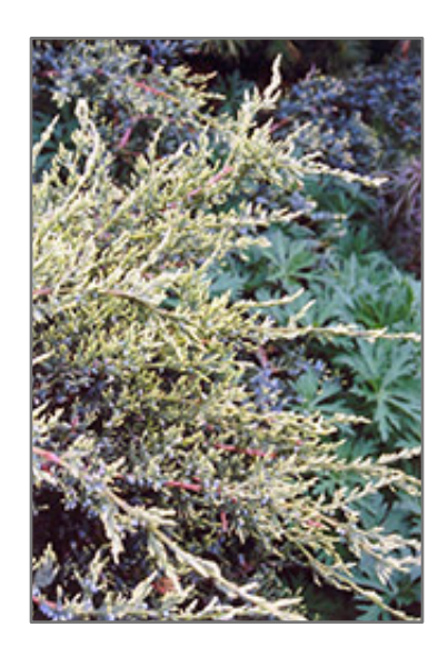
Holger Juniper foliage