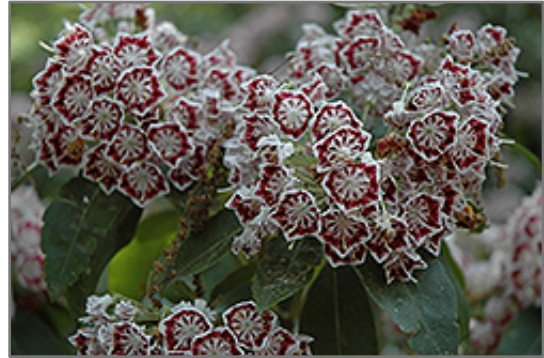
Bullseye Mountain Laurel flowers

This is a stunning spring blooming broadleaf evergreen shrub with amazing frilled white flowers with a purple band and bronze emergent foliage; must have superbly drained highly acidic and organic soil with a heavy mulch